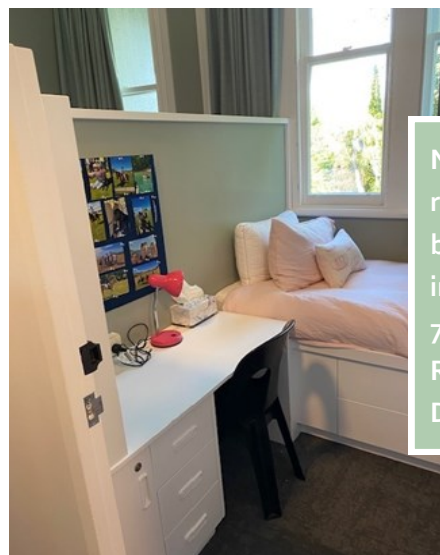
Newly renovated bedroom in Year 7&8 Raukura Dorm